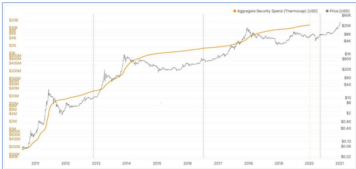
Figure 1. Bitcoin price and aggregate security spend, USD

Notes: Bitcoin's cumulative miner revenue – Thermocap – is calculated by taking the running sum of daily miner revenue in USD. Market capitalization to Thermocap provides an indication of the Bitcoin's current market value compared to the aggregate amount spent to secure the network. Note that, due to lags in the adjustment of mining investment, Thermocap is relatively slow moving and does not have the same level of volatility as the market capitalization.